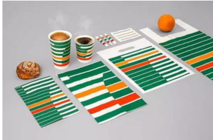
Figure 3 Visual communication

With the development and extension of visual communication design in the past, the related graphic and web design has opened up a new lead with the help of new media and relevant advanced technology. About visual design, on the basis of the core theoretical guidance of web design, not only need to follow the strict rules of the past, the specific setting of traditional aesthetics. In addition, in the specific network system design development process, also needs to follow the related advanced design theory as a major research basic education. Overall, the core of web design, including graphic design and web settings. As a Chinese Internet enterprise, users can manage information and view the main carrier of information, there are certain contradictions in the design process of web graphics, need to follow both simple but in a sense there is a certain complexity. On the one hand, we should follow the basic design principles of traditional aesthetics in order to ensure its simplicity and beauty, but avoid too complex in the specific design. On the other hand, there is a need to ensure diversity and diversity in web design[2]but need to be based on the design for different information related to graphics and make corresponding identification and classification. And with the problems in the process of individual design of graphics, we should take the overall economic situation as the core, analyze and consider as a whole, and make the center prominent and beautiful and generous.