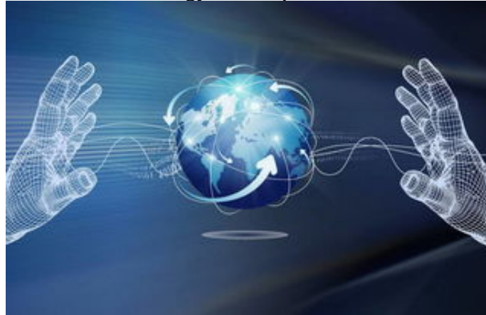
Figure 2 Integration of visual communication information technology

development of using information technology, in this process